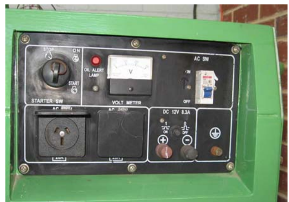
5 kW Diesel generator running on biodiesel